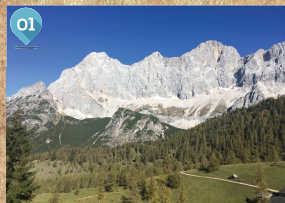
01 Hoher Dachstein / Türlaufhütte = Ramsauer Platten = Schladming